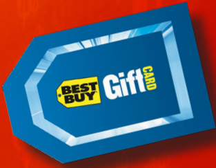
Best Buy Gift Card