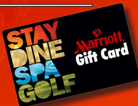
Marriott Hotel Gift Card