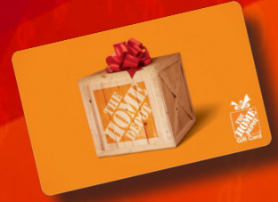
Home Depot Gift Card