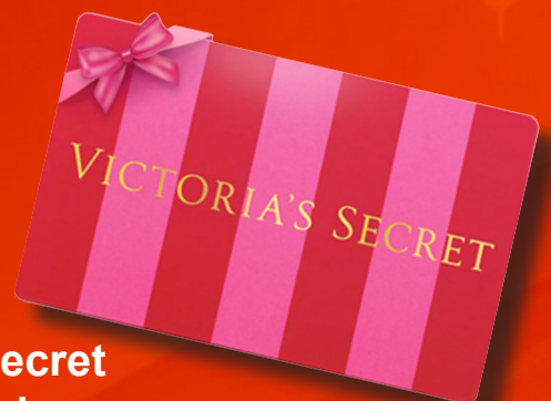
Victoria's Secret Gift Card