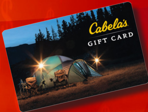
Cabela's Gift Card