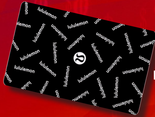
Lululemon Gift Card