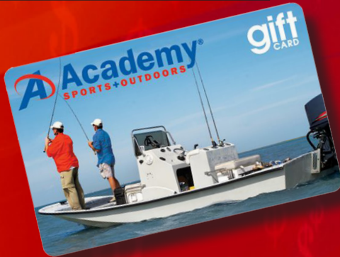
Academy Gift Card