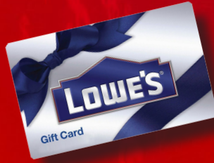
Lowe's Gift Card