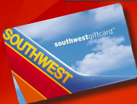
Southwest Airlines Gift Card