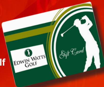
Edwin Watts Golf Gift Card